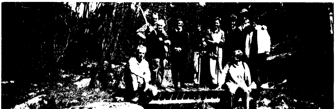
Ryans Lookout to Wenhams 5 - 9 - 99