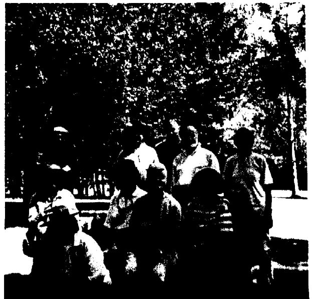
Happy group at Alpine Park.