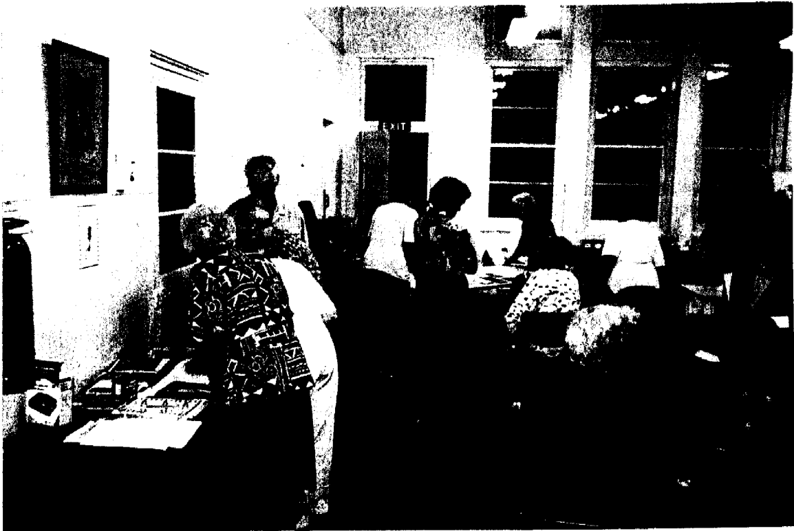
Reminiscing and viewing memorabilia at the A.G.M.