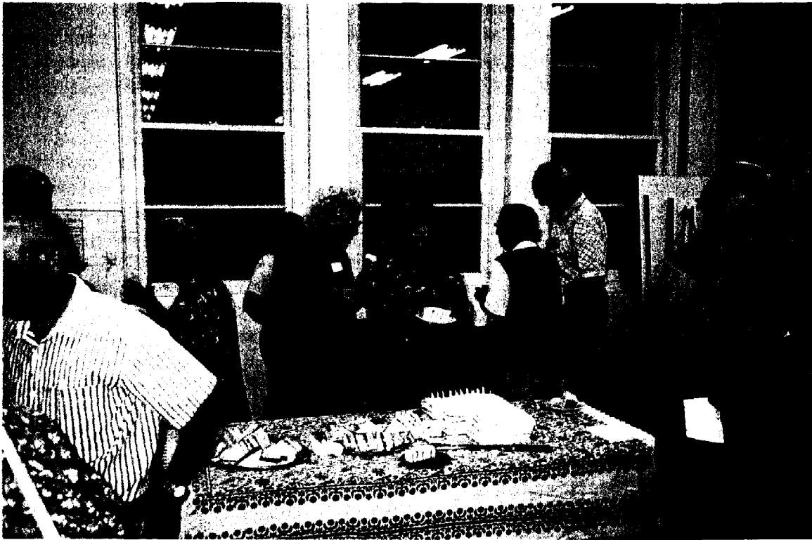
Members enjoying the supper at the A.G.M.

and have seen the ups and downs of the club and its members over the last twelve years.