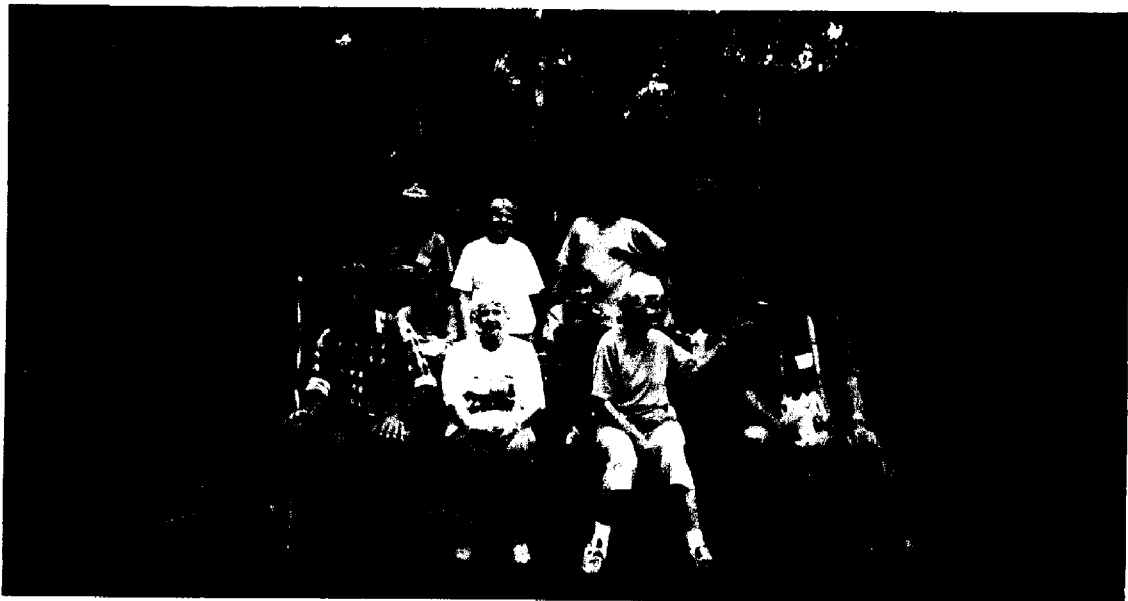
Happy group at Mountain Creek.