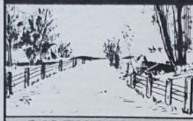
ON THE TRACK