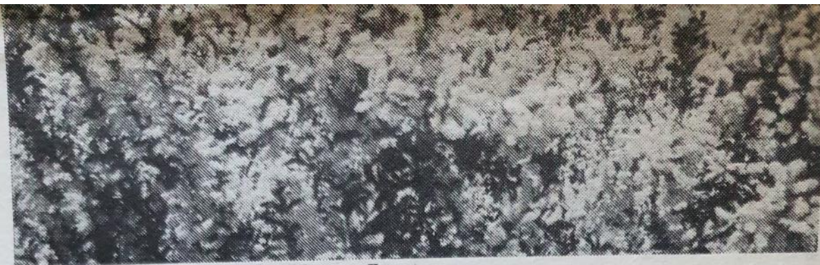
The full glory of golden wattle in Killawarra Forest.