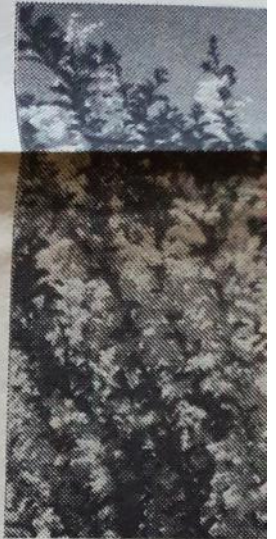
The full glory of golden