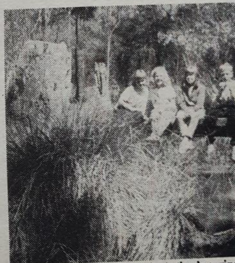
The children who took part in Arthur's spring