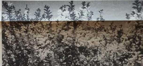
The full glory of golden wattle in Killawarra Forest.