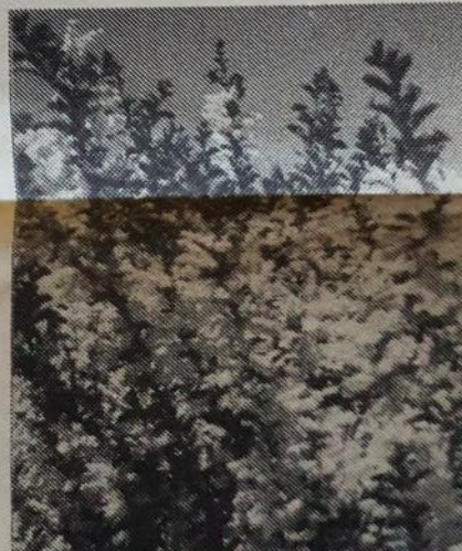
The full glory of golden wattle in Killaw