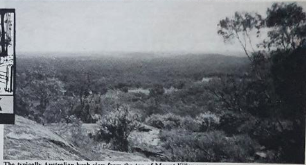
The typically Australian bush view from the top of Mount Killawarra.

Carnivore scats should never be smelled but herbivore scats have a distinctive plant smell,