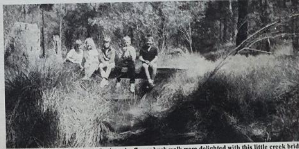
The children who took part in Arthur's springflower bush walk were delighted with this little creek bridge.